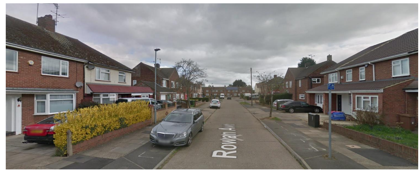
Rowan Avenue (Google Street, 2019)