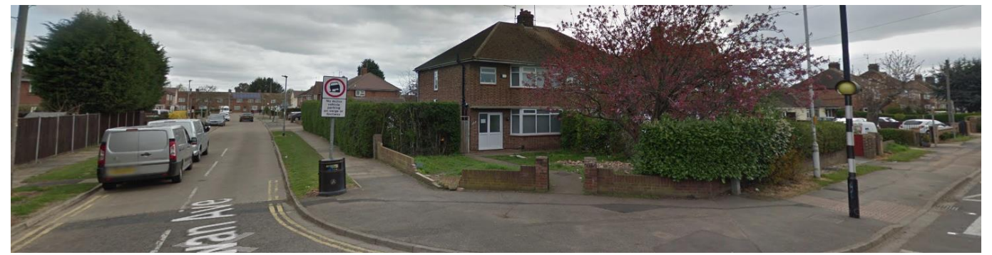
Corner of Newark Avenue and Rowan Avenue (Application site within foreground)